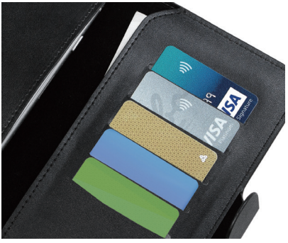
5 Card Slots