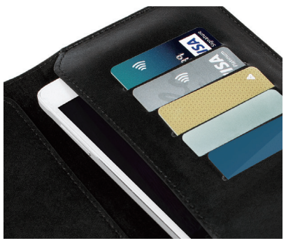
2 Pockets for Cellphone/Cash