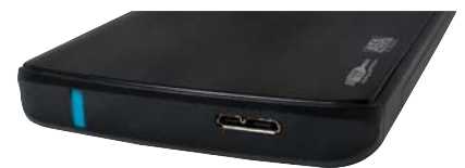
USB3.1 Gen II connector with LED indication