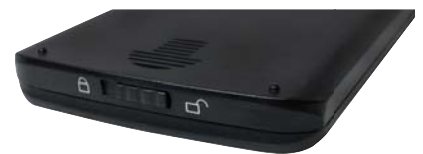
Safety HDD lock